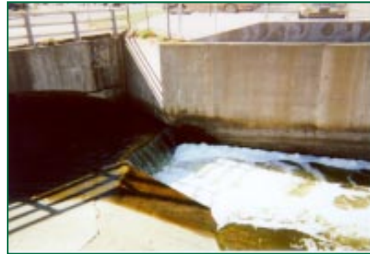
Naturally-occurring foam: on Stoney Creek in Southeast Michigan and on Grand River in the Jackson area.

Some foam in water can indicate pollution. When deciding if the foam is natural or caused by pollution, consider the following: